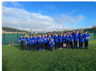
1:39 PM - Dec 9, 2022

Linton Village College @LVCCollege Congratulations to our cross country runners who competed on a tough course in bitter, muddy conditions yesterday. They showed amazing effort and resilience and a number qualified to the next stage. 🏃🏆